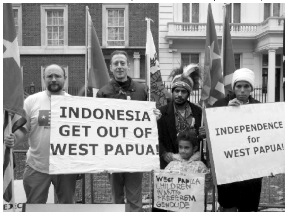
Photo: members of the Free West Papua campaign